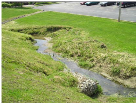
This unnamed tributary to Sewickley Creek runs in front of Founder's Hall at Westmoreland County Community College and is currently impaired by parking lot and roadway runoff.

As noted in our previous newsletters, the Sewickley Creek Watershed Association (SCWA) is conducting a comprehensive watershed assessment, restoration and implementation plan to identify pollution sources affecting various stream segments throughout the watershed. The study will examine the effects of these pollution impacts and prioritize Sewickley Creek stream segments for restoration.