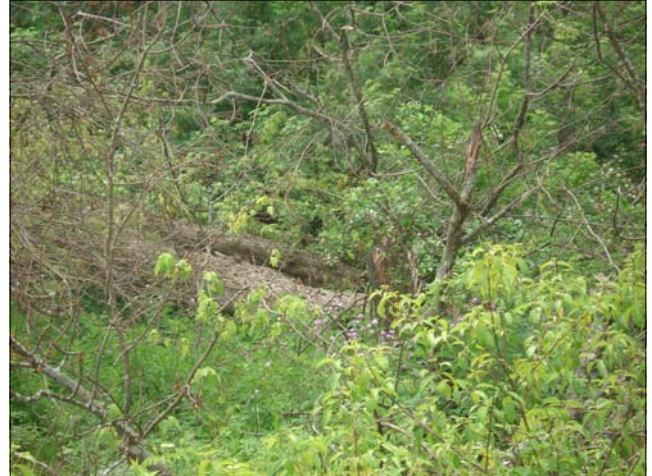
The remnants of an ancient oak tree lay beside the Brinkerton Project Site.

prove them. One of the most recent incidents came just prior to deer season last winter, when a “sportsman” decided to cut a nearly hundred year-old tree down with a chain saw in order to gain access to the opposite side of the stream. You can imagine the shock at seeing a perfectly healthy old oak tree felled across the stream, apparently to use as a foot bridge.